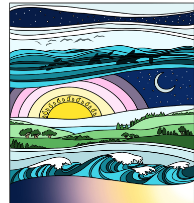
Caring for God's Creation

When I am weary, filled with despair Who gives me courage to go on from there? And who gives me faith that will never die Somebody bigger than you and I